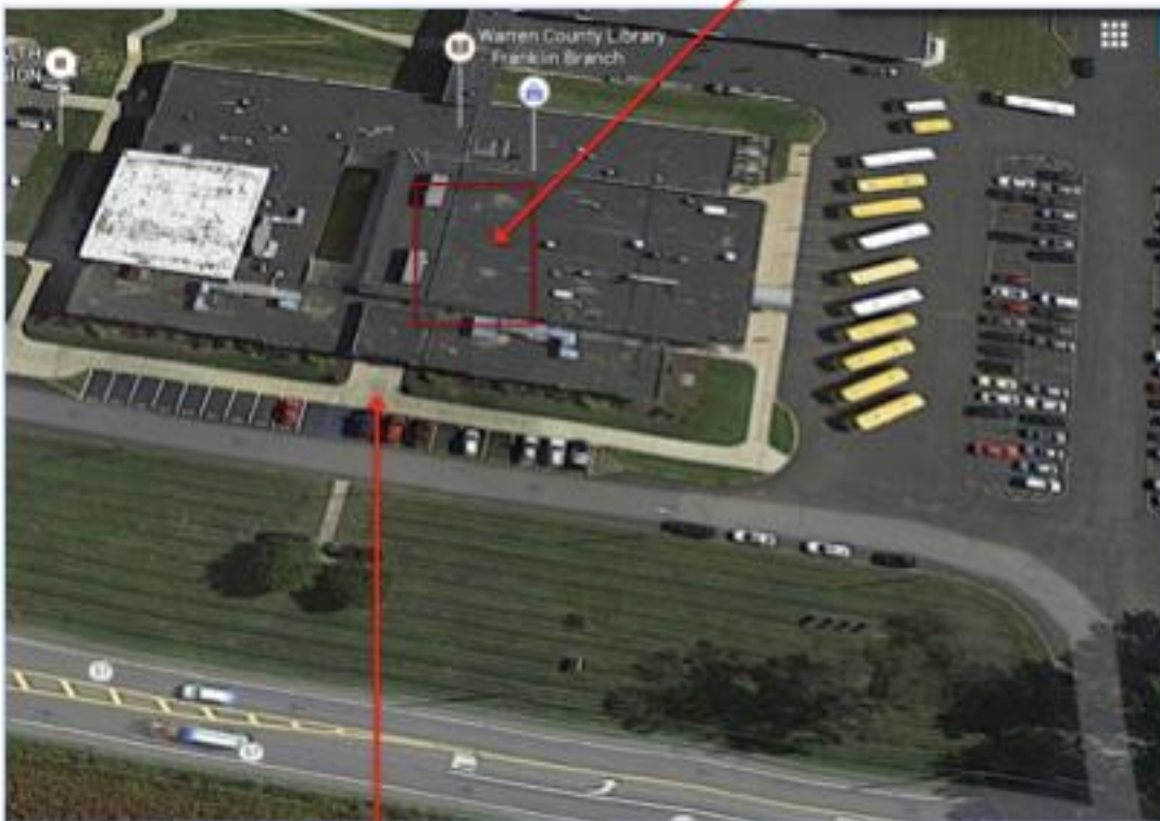
School Main Entrance